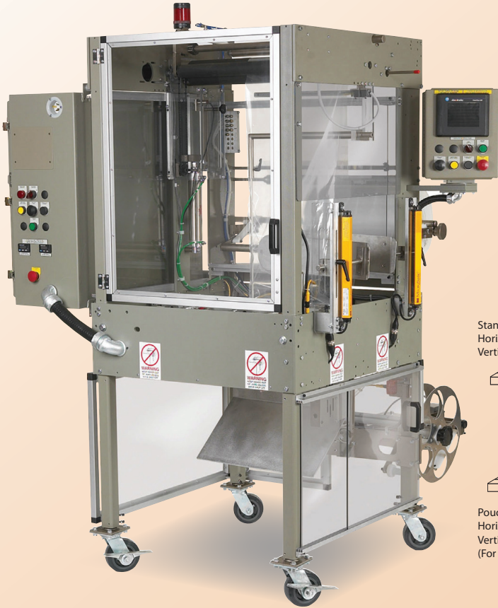
Standard Seal Assembly Horizontal Seal Above Vertical Seal