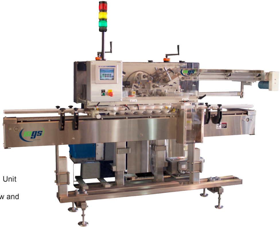
TopSert II Right-hand Unit with 48" Long Powered Magazine, Timing Screw and Bottle Conveyor