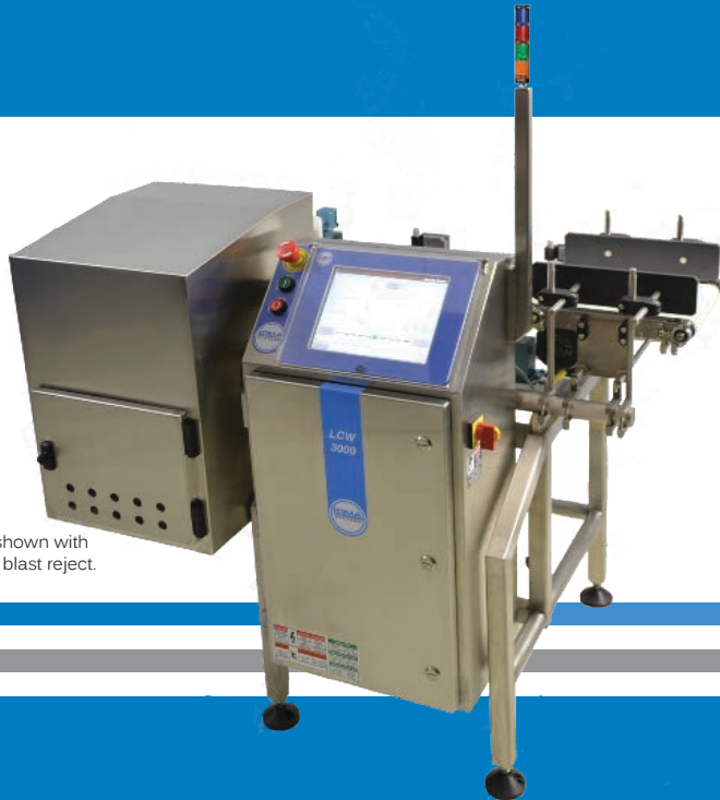
LCW 3000 shown with optional air blast reject.