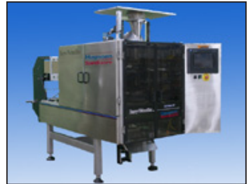
Stainless Steel System

A few of the many available options include stainless steel construction, various hole punches, tear notches, code daters, gas flushing, static eliminators and tucking devices. We have extensive experience in integrating a wide variety of feed systems including scales, augers, volumetrics and pumps for a wide variety of applications.