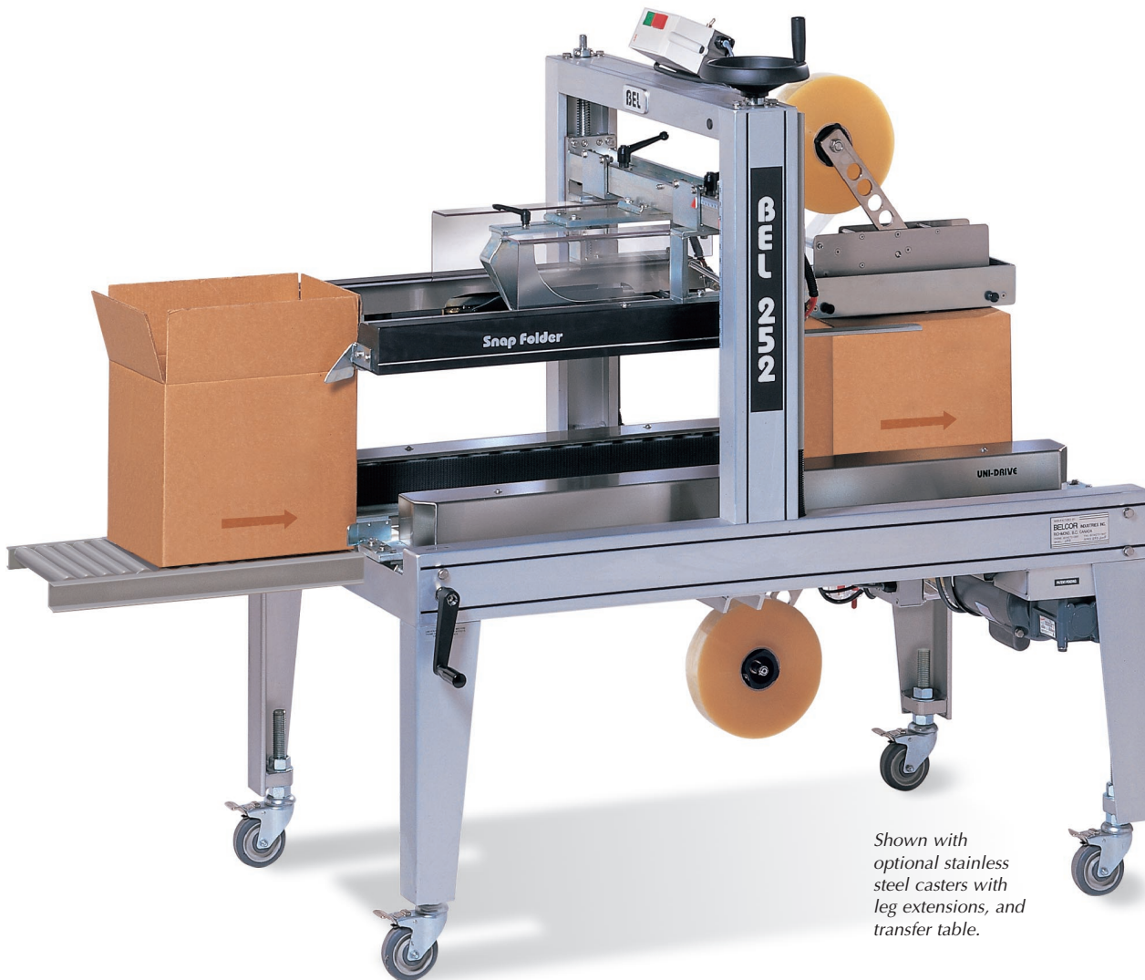
Shown with optional stainless steel casters with leg extensions, and transfer table.