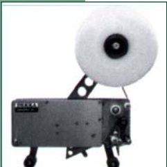
DEKKA Tape Head