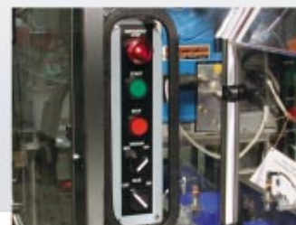
The operator control interface is located within easy reach.