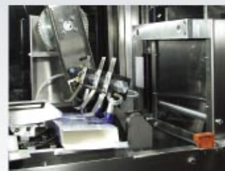
The single head rotary carton feeder allows for easy changeovers and a wide standard carton size range.