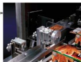
Optional ADCO deboss coder to imprint the date/batch code on your cartons.