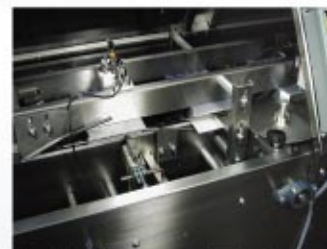
The 15DZ comes standard with a horizontal tucking disc that will accommodate any product type including bag-in-box.