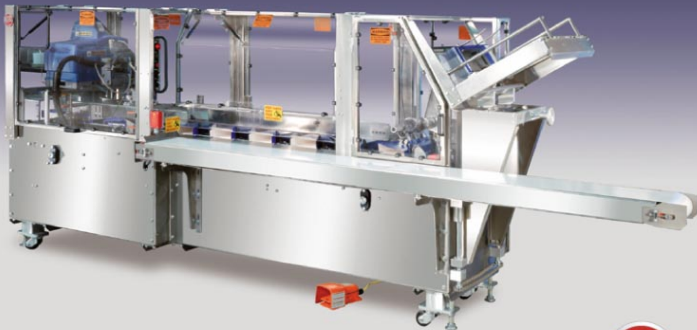
Shown with optional product supply conveyor.