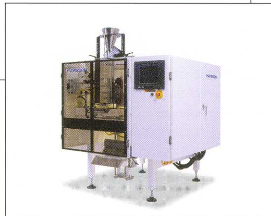
The Series 1000 is available as a standalone machine or integrated with vertical form/fill/seal equipment.