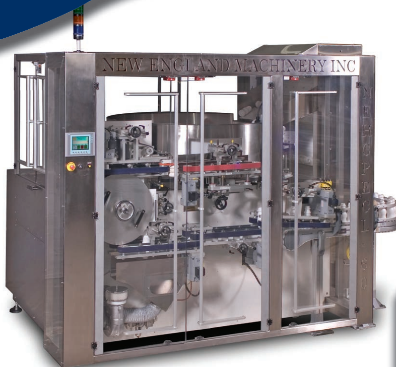
NEHCPCL-60 compact unscrambler. Track & Trace ready (Shown with optional ionized air rinser, HMI and light stack)

The New England Machinery, Inc. NEHCP-60 is a compact unscrambling system. This model offers a compact, space saving footprint due to an integrated hopper elevator resulting in two machines in the space of one. The NEHCP-60 is designed for high efficiency and high output.