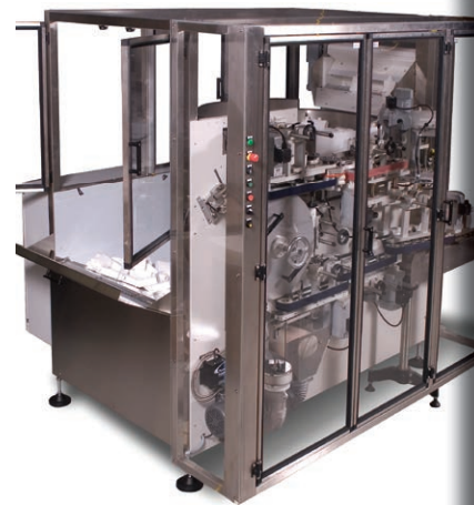
Easy for loading bottles. Shown with optional ionized air rinser.