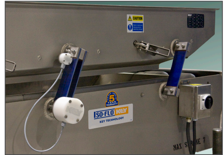
SmartArm® Installed on an Iso-Flo®

Forté™ Modular Controls provide a single point of power and control for simple to complex processing and packaging lines for optimal efficiency.