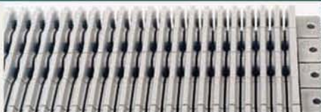
▲ Blade ejection-type slats