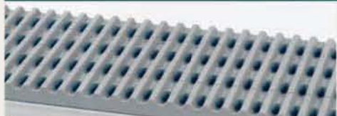
▲ Standard type slats