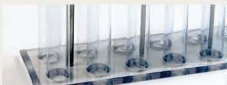
▲ Screwless design lower manifold