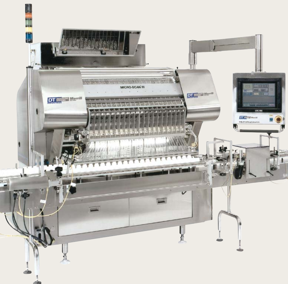
▲ Merrill Model 72-39 HY

Merrill Fillers provide superior performance in pharmaceutical product counting and container filling.