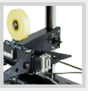
Perfect for high profile, lightweight, unstable, narrow boxes

Little David delivers packaging equipment that works for you