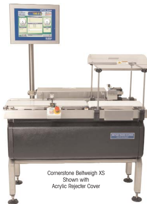
Cornerstone Beltweigh XS Shown with Acrylic Rejecter Cover

Cornerstone checkweighers are available with machine mounted Safeline metal detectors. Shown with the XE checkweigher control, and separate metal only rejecter, the Safeline metal detectors are a perfect addition to complete the product inspection process.