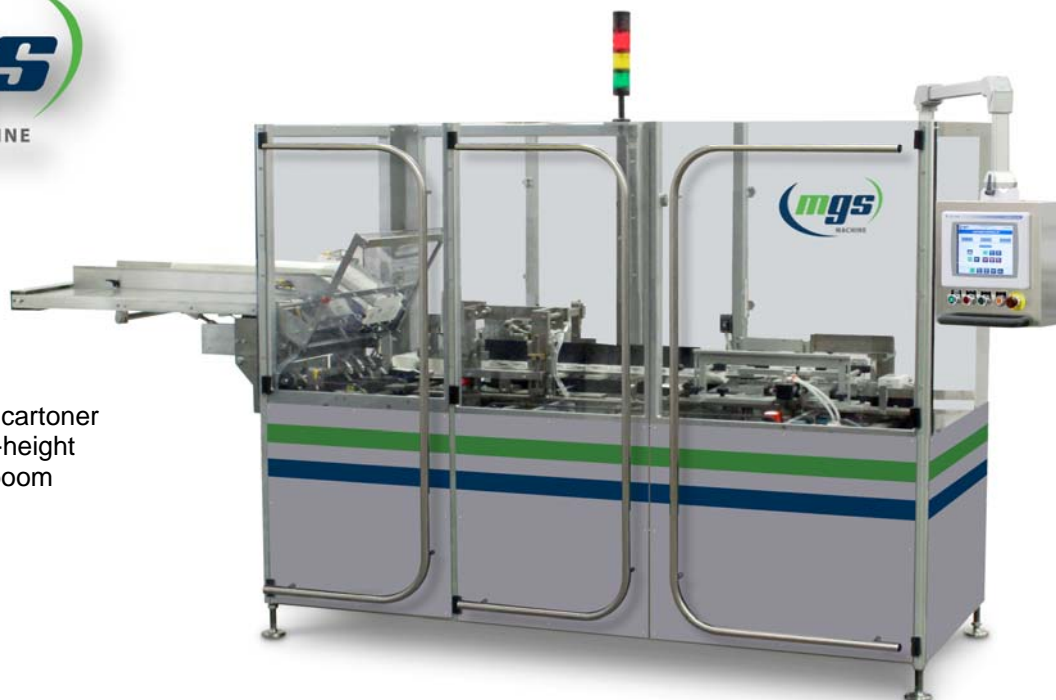
Model RCS-150 cartoner with optional full-height doors and HMI boom mounting