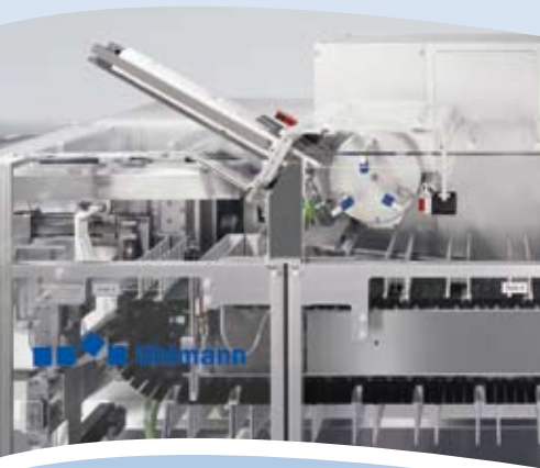
Rotary card feeder