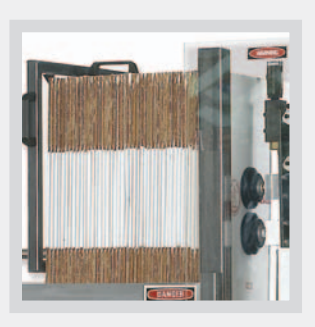
Patented load-on-the-fly powered hopper