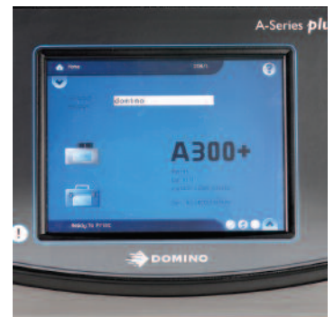
Optional touch screen control