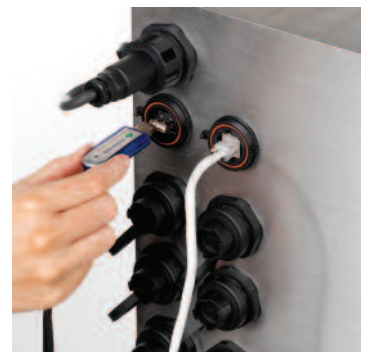
Ethernet and USB ports as standard