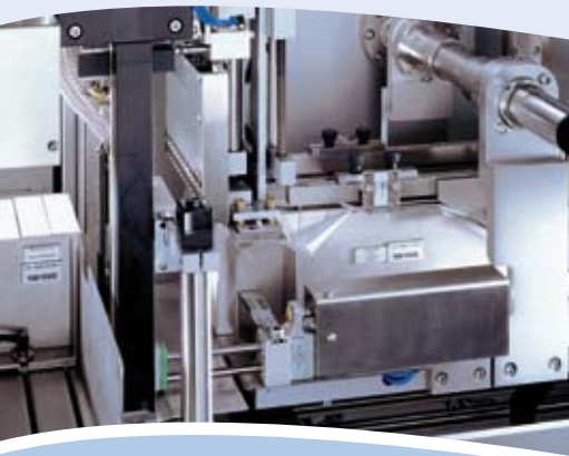
Cross sealing station and folding function