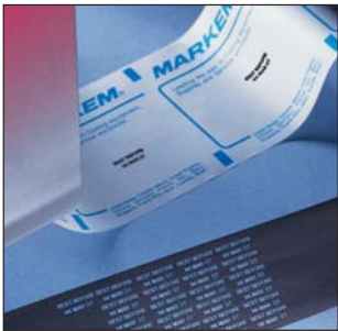
Radial ribbon save - delivering up to 80% savings in continuous mode.

In addition to precise 'no-waste' printing, you get a series of unique ribbon saving techniques for both intermittent and continuous operation.