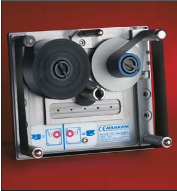
The SmartDate 5 cassette-rugged construction resists accidental damage.

You'll see right away that it's engineered to withstand years of productive use in the most demanding factory environment.