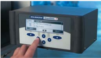
Standard Graphic User Interface

In addition, you can simultaneously operate up to four SmartDate coders from one SmartTouch user interface.