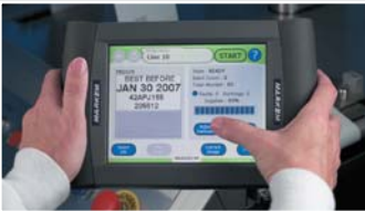
SmartTouch User Interface