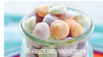
FREEZE DRIED YOGURT DROPS