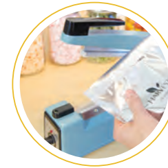
PACKAGE IT PROPERLY