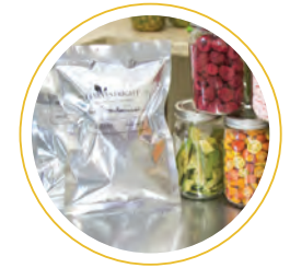
STORE IT IN A SAFE, COOL LOCATION