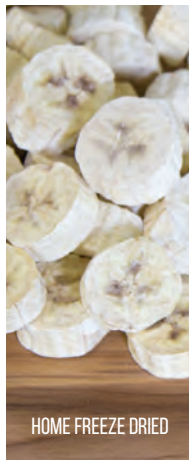
HOME FREEZE DRIED

A home freeze dryer is the best way to prepare for times of adversity, allowing you to easily preserve anything you eat. And, when packaged properly, the food will taste great and retain nearly all of its nutritional value for 25 years.