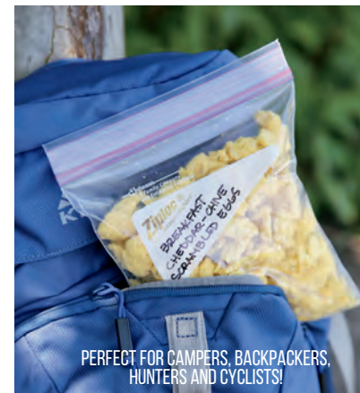
PERFECT FOR CAMPERS, BACKPACKERS, HUNTERS AND CYCLISTS!