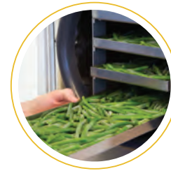
PRESERVE WHAT YOU ALREADY EAT