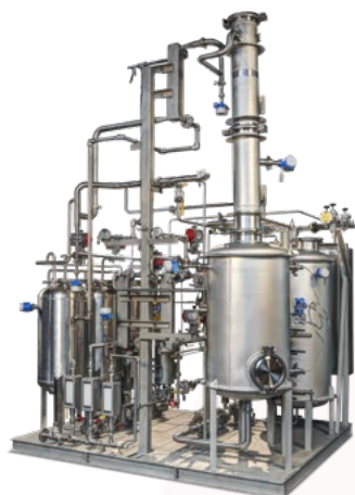
Forced Circulation Evaporators