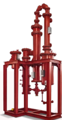
Natural Circulation Rising Film Evaporators