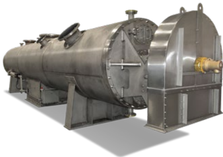
Vacuum Rotary Dryer