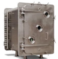
Vacuum Shelf Dryer