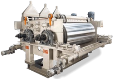
Atmospheric Double Drum Dryer

Our dryers and cooling flakers are designed and built for performance, precision and reliability. Atmospheric Drum Dryers are available in Single, Double and Twin Drum designs. Vacuum Dryers include Double Drum, Rotary, Pan/Kettle and Shelf designs. Single Drum Cooling Flakers are available for flaking and solidification.