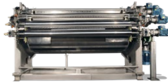
Atmospheric Single Drum Dryer