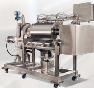
Cooling Drum Flaker