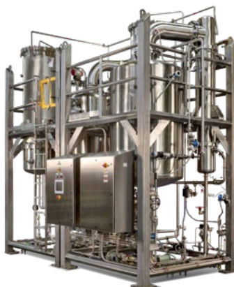
Rising Falling Film Evaporators