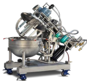
Vacuum Pan (Kettle) Dryer