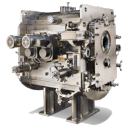
Vacuum Double Drum Dryer