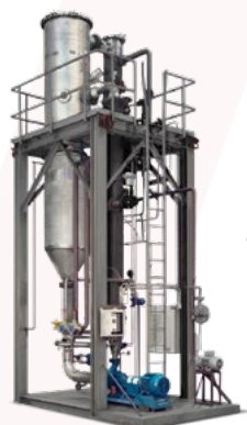
Distillation Systems & Heat Transfer Equipment