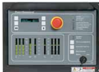
PowerCommand 2100 control operator/display panel