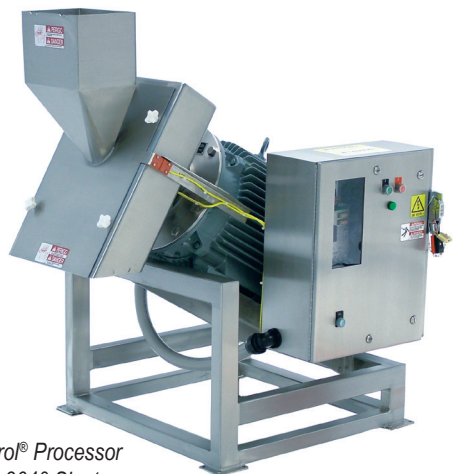
Comitrol® Processor Model 3640 Slant