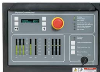
PowerCommand 2100 control operator/display panel