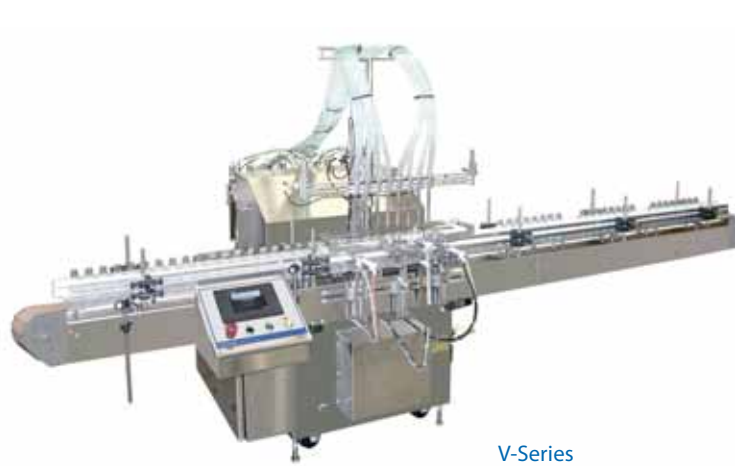
V-Series Flexible Design, Wide Range of Piston Pump Sizes, Product Viscosity and Speeds