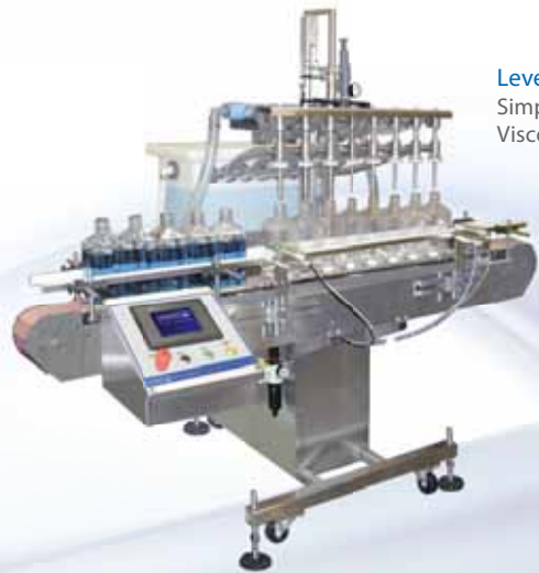
Level Filler Simple Design for Low Viscosity Products