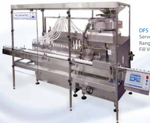
DFS Servo Controlled, Wide Range of Metering Systems, Fill Volumes, and Fill Rates