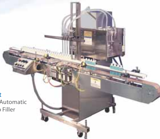
Synchromat Entry Level, Automatic Piston Pump Filler