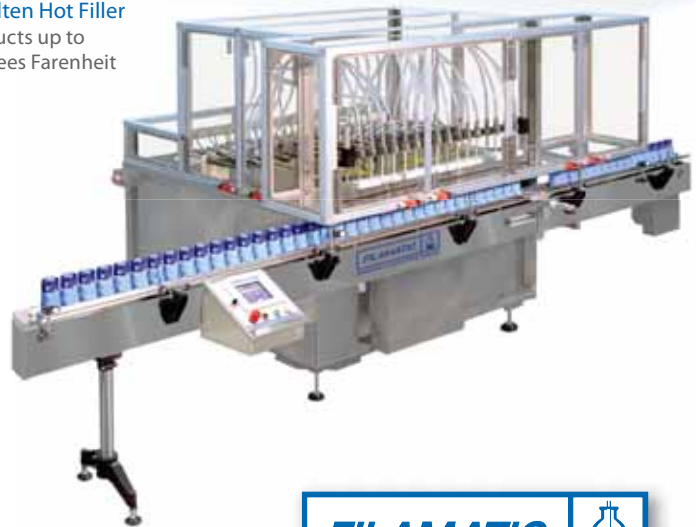
H-CE Molten Hot Filler Fills Products up to 200 Degrees Farenheit